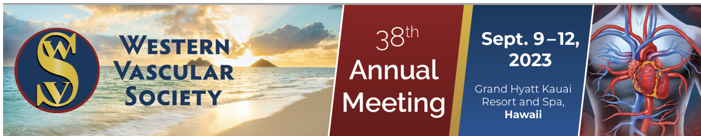
EXHIBIT OPPORTUNITY LEVELS