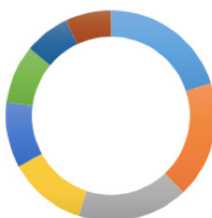
Types of Practice