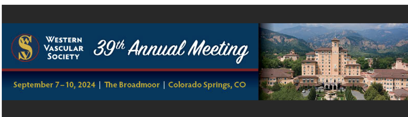
EXHIBIT OPPORTUNITY LEVELS